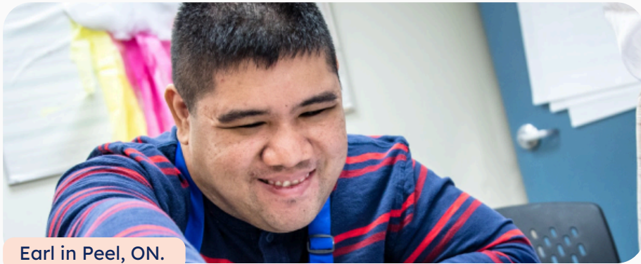
Earl in Peel, ON.

We recognize the need for holistic supports. We believe that a person is more than the sum of their parts. It is impossible to totally capture a person's existence into a few words and phrases. We recognize that people with disabilities are at risk of being seen in a fragmented way, with needs in various areas; therefore we will promote: