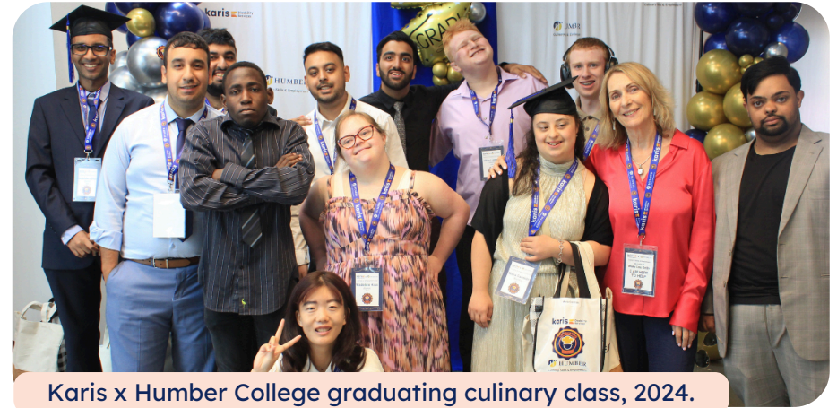
Karis x Humber College graduating culinary class, 2024.

As early as the first century AD, it was reported that