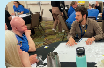
Peterborough Karis Connected Everybody Engages Session, May 2025