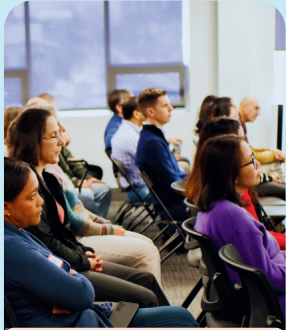
Waterloo Office Meeting, December 2025