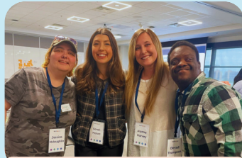
Toronto Karis Connected Everybody Engages Session, May 2025