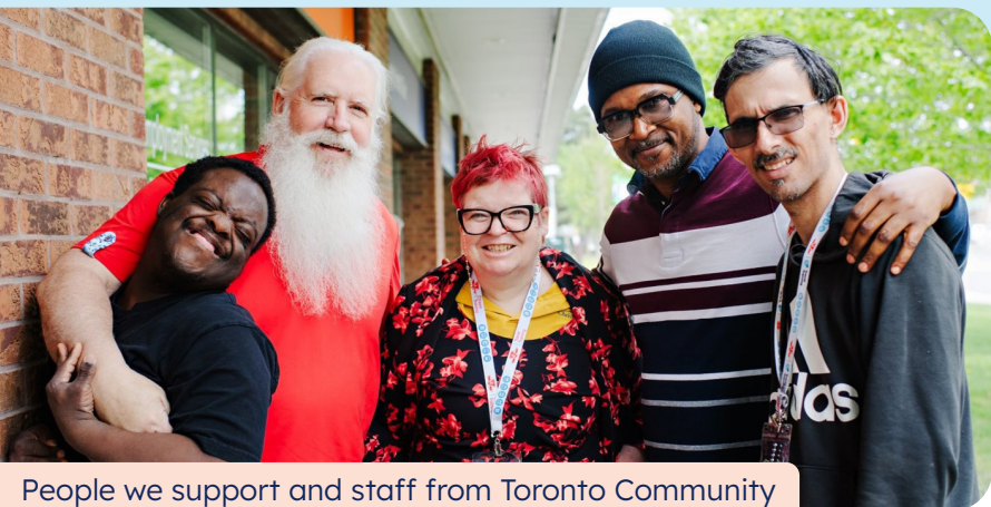
People we support and staff from Toronto Community Participation Supports, 2025

beyond words to discern the mental models and systemic structures that limit inclusion and connection, and identifying the enablers—such as trust, leadership, and shared purpose—that foster lasting belonging.