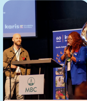
Leaders Conference in Muskoka, 2025

Karis Connected Everybody Engages Sessions across Ontario and Saskatchewan